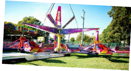
CHA CHA (8 tickets)