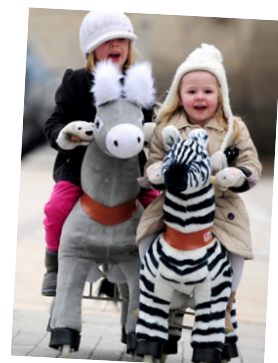
GIDDY UP PONIES (5 tickets)