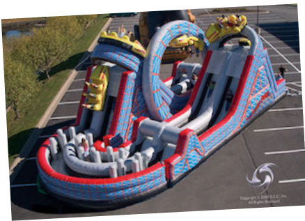
WILD ONE ROLLER COASTER (5 tickets)