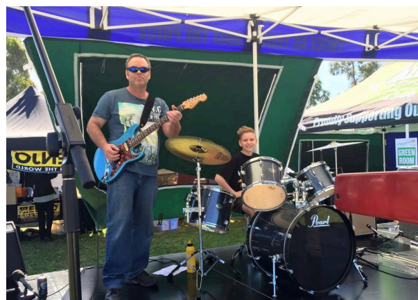
Some of our talented acts from the 2015 Spring Fair: (Top to bottom) Aspect Motion School of Dance, Taiko Group, 'Vinyl Time'