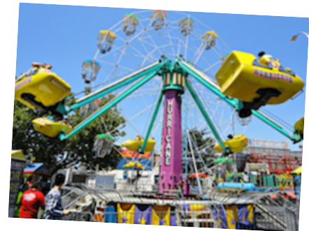
HURRICANE (8 tickets)