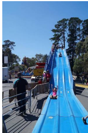
GIANT SUPER SLIDE (4 tickets)