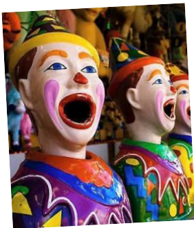
LAUGHING CLOWNS (separate cost)