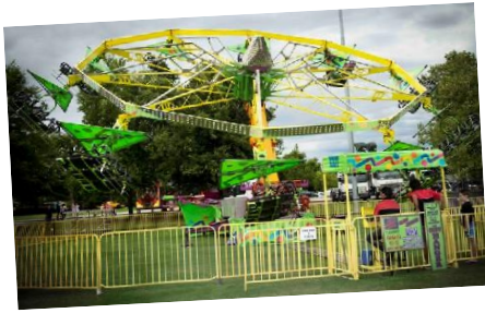
CLIFF HANGER (6 tickets)